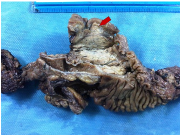
Figure 1. Pancreaticoduodenectomy specimen showed a growth measuring 1.5x1.0 cm. in the periampullary region (arrow).

Ectopic pancreatic tissue turn out during surgical exploration is rare, accounting for less than 0.5% of laparotomy, but it is found in 13.7% of autopsies [3]. Common sites of ectopic pancreas are duodenum and gastric mucosa although theoretically it can occur anywhere in the body. Few cases have been reported in the literature as periampullary mass lesion resulting in obstructive jaundice [10, 11, 12]. Clinical presentation of our case is similar to the earlier cases which reported in literature as mimicker of periampullary carcinoma. Hammastromm et al. described 10 cases of ectopic pancreatic tissue in which one patient had endoscopic sphincterotomy done and the endoscopic biopsy