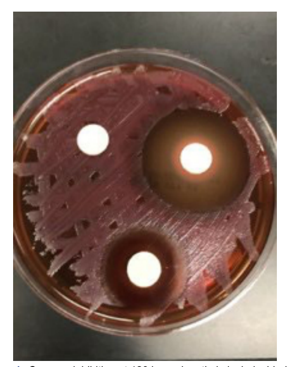
Figure 1: C. acnes inhibition at 120 hours by ethyl alcohol, chlorhexidine and BAC.

Note: Each value represents the mean of 8 individual trials