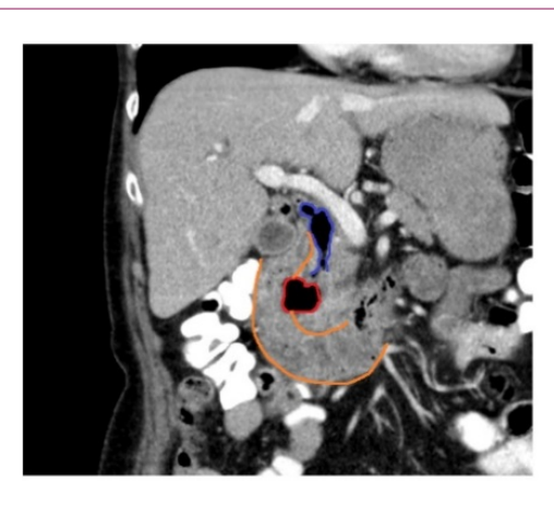
Figure 2 Orange: duodenal configuration with inflammatory respons; Blue: Aerobilla (Common Bile Duct); Red: Juxtapapillary diverticula.