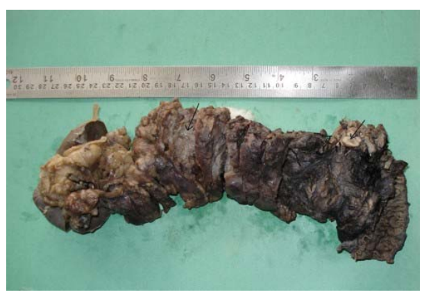
Figure 2. Total pancreatectomy specimen showing diffuse replacement of the pancreas with multiple cysts. Multiple lymph nodes (solid areas shown by arrows) are also seen adherent to the uncinate process and body.

A diagnosis of diffuse serous cystadenoma was made, and the patient was explored through a rooftop incision under anesthesia. Intra-operatively, we found that the entire pancreas (including the uncinate process) had been distorted and replaced by cysts of variable sizes, up to 4 cm. Remarkably, dissection was uneventful, except in a part of the uncinate process which was intimately related to the wall of the portal vein, but not invading it. A total pancreatectomy was performed,