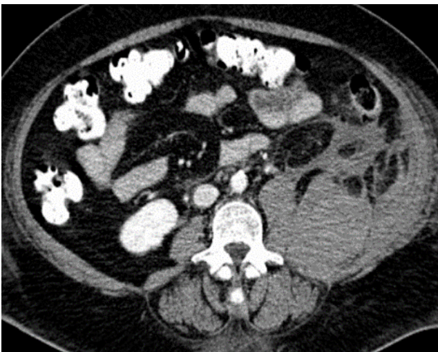
Figure 2: Urgent CT-scan, suspecting an origin of the bleeding on the right lumbar artery.

The patient was constipated, and clyster was applied. After the evacuation, the patient was pale, and continued with the sensation of abdominal fullness. She presented pain with the palpation and a mass was noted in the left iliac fossa, but the Blumberg's sign was negative. A new blood test showed a blood loss (haemoglobine 6.8 g/dL) and a moderate leukocytosis ( 21.1 \times 10^9 \text{ L}^{-1} ). Under the suspicion of being in