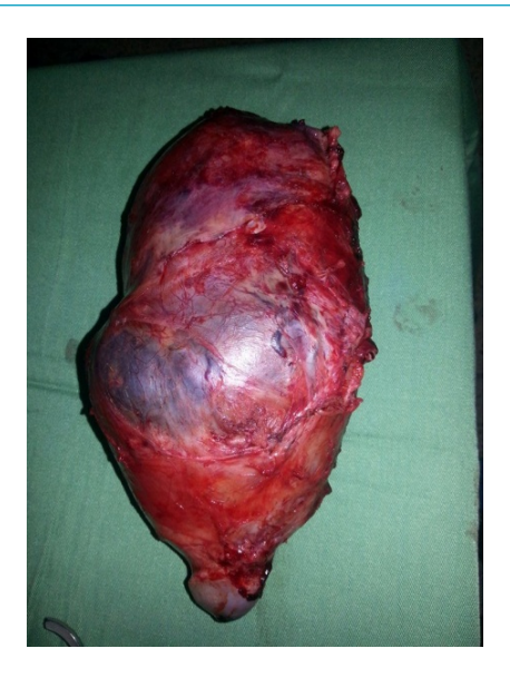
Figure 4 Secondary hysterectomy for haemorrhage

Resection under hysteroscopy was performed in an asymptomatic patient because of an ultrasound finding of placental retention.