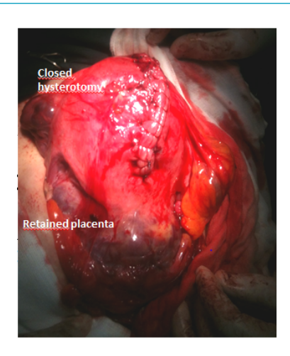
Figure 1 Conservative treatment placenta percreta; HCN Tunis 2012

Thirty one cases (0.2%) of placenta accreta were observed in 15,633 deliveries during the study period. Of the 31 cases, 13 patients (42%) were treated by conservative management. the entire placenta was left in situ in all cases. The final diagnosis was confirmed by a clinical diagnosis of placenta percreta ( Figure 1 ).