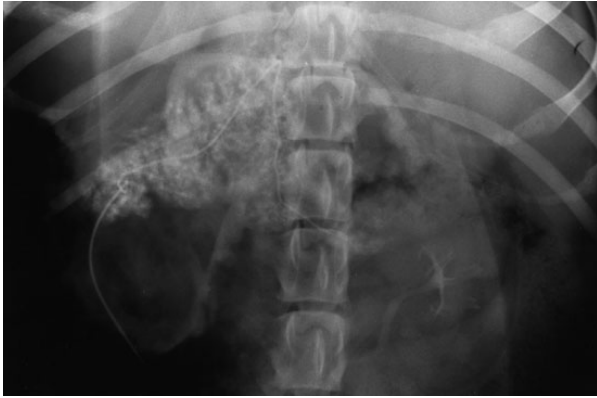
Figure 1. Fluoroscopic image of canine pancreas after contrast injection showing marked acinarization of the pancreatic duct.

mitochondria affected), and severe (greater than 50% of mitochondria affected). Comparisons were made between the dogs injected with ionic high osmolar contrast and the dogs injected with non-ionic low osmolar contrast for the presence of pancreatitis on light microscopy and for the presence of cellular damage on electron microscopy.