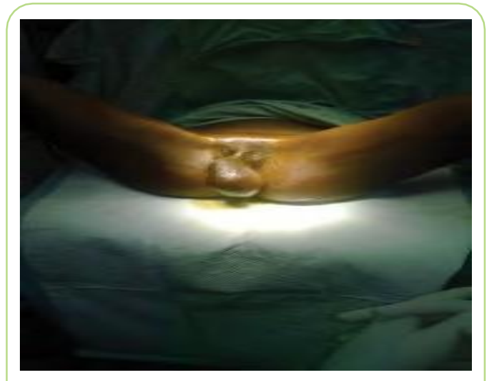
Figure 1 Clitoridal epidermal

Histopathologic evaluation reported a cyst lined by stratified