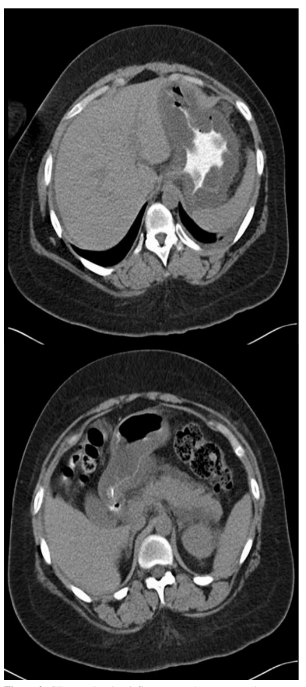
Figure 2. CT scan showing inflammatory changes around pancreas with small amounts of peripancreatic fluid, thickening of stomach all, and free fluid in the pelvis, all consistent with pancreatitis.

changes around the pancreas with small amounts of peripancreatic fluid, thickening of the stomach wall, and free fluid in the pelvis, all consistent with pancreatitis (Figure 2). She was also found to have worsening kidney function with a creatinine of 5.3 mg/dL. APACHE II score was calculated to be 22, indicating 28.6% mortality. SLEDAI (systemic lupus erythematosus severity index) was calculated to be 29. The patient was treated as presumed catastrophic antiphospholipid syndrome. Initial treatment included six sessions of plasmapheresis without intravenous immunoglobulin to avoid further kidney damage, and