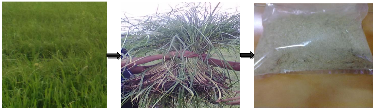
Figure 1: Collection of Cyperus rotundus plant from crop field and conversion into powder form.

Cyperus rotundus plant was collected from crop field near to Vellore city. Plant was cut into pieces of 2-3 cm and dried for 4 days, subsequently oven dried at 70 °C for 6 hours and then ground into fine powder using high speed blender.