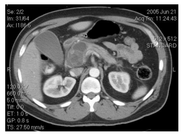
Figure 1. CT abdomen showing pseudocyst in the head of the pancreas compressing the common bile duct and duodenum.

Two weeks after the initiation of azathioprine, he was admitted with severe abdominal pain, nausea and vomiting and elevated amylase and lipase. The pancreatic pseudocyst of the head of the pancreas was increased in size (4.0x3.9 cm), the remainder of the hypodense lesions of the pancreas were also slightly larger in size. A diagnosis of azathioprine-induced pancreatitis was made, as exploration for other causes of worsening was negative. He had a EUS evaluation to rule out other causes including intraductal papillary mucinous neoplasm. He had no history of alcohol abuse or cigarette smoking. There was no evidence of choledocholithiasis and evaluation of the medication list for any cause of pancreatitis other than azathioprine negative. Azathioprine was stopped and was mycophenolate mofetil was started for autoimmune hepatitis and autoimmune pancreatitis. Repeat CT after 4 weeks for persistent abdominal pain, nausea and vomiting showed extrinsic compression of the duodenum by the pseudocyst (Figure 1). ERCP with cyst duodenostomy was performed at that time with subsequent improvement of symptoms and biochemical improvement.