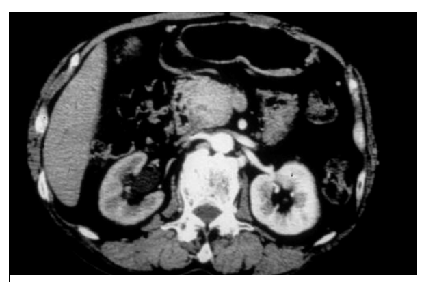
Figure 2. CT showing peritoneal soft tissue surrounding the aorta associated with right hydronephrosis (Case 1).

(Figure 3). He was diagnosed as having autoimmune pancreatitis associated with retroperitoneal fibrosis, and underwent steroid therapy. After 3 weeks, a follow-up CT showed a marked reduction in the size of both the pancreas and the retroperitoneal mass.