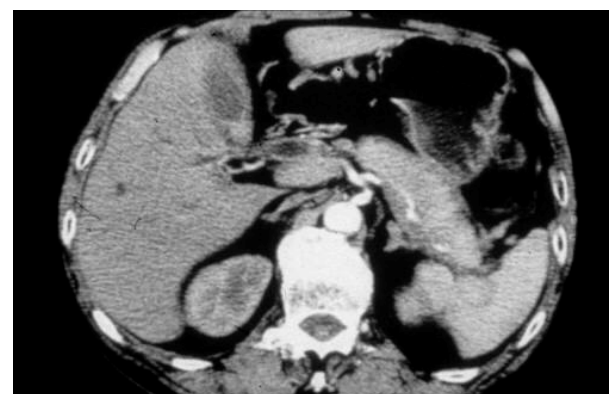
Figure 1. CT showing enlargement of the pancreas (Case 1).

A 71-year-old male developed anorexia and lost 6 kg over 2 months. He had a history of alcohol intake (20 g/day for 50 years) and smoking (20 cigarettes/day for 50 years). Laboratory studies disclosed the following relevant values: total serum bilirubin 1.1 mg/dL (reference range: 0-1.0 mg/dL), aspartate aminotransferase (AST): 55 IU/L (reference range: 0 - 35IU/L), alanine aminotransferase (ALT) 60 IU/L (reference range: 0-39 IU/L), and alkaline phosphatase (ALP) 1,359 IU/L (reference range: 0-350 IU/L). Serum IgG, IgA and IgM were within the normal range. Serum IgG4 was not examined. Abdominal ultrasonography (US) and computed tomography (CT) showed a diffuse swelling of the pancreas (Figure 1), mild dilatation of the bile duct, and peritoneal soft tissue surrounding the aorta associated hydronephrosis (Figure with right Endoscopic retrograde pancreatography showed narrowing of the main pancreatic duct