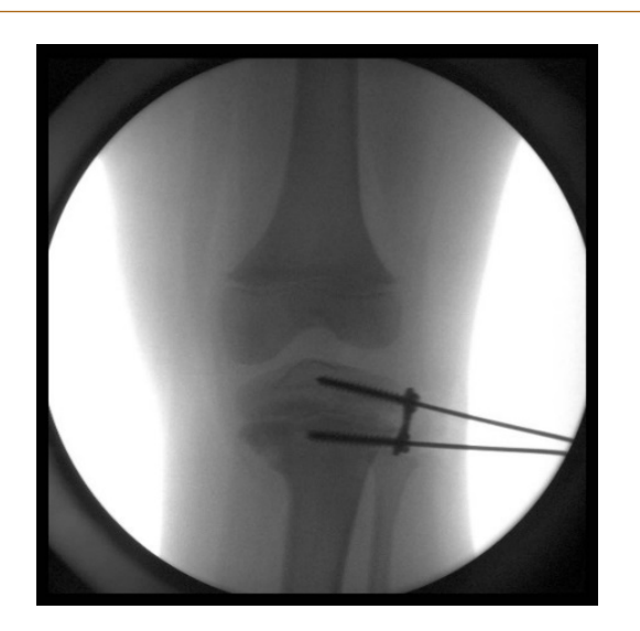
Figure 2 Intraoperative fluoroscopy image of screw/plate construct for hemiepiphyseodesis procedure.

Figure 1 Standing AP radiograph of the lower extremities demonstrating varus alignment of left tibia, changes of the proximal medial left tibial physis, and unremarkable alignment of right lower extremity.