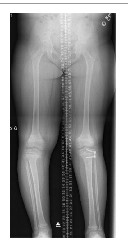
Figure 3 Follow-up standing AP radiograph demonstrating correction of mechanical axis on the left with new onset tibial physeal changes and varus malalignment of the right tibia.

However, it was now obvious that she had developed a new deformity of the contralateral right leg. In addition, her BMI had increased in the interim, from 25.48 kg/m<sup>2</sup> initially, to 28.19 kg/m<sup>2</sup> upon return presentation. Standing radiographs demonstrated correction of the left limb deformity. However, there was the appearance of new changes of the right medial proximal tibial physis and angular deformity consistent with Blount's Disease in a limb that had been uninvolved one year previously (Figure 3). In light of the uncomplicated correction of the left limb deformity, removal of the left plate and screw device is planned simultaneously with a similar growth modulating procedure of the right proximal tibia.