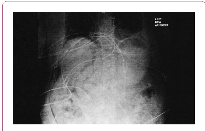
Figure 2 : Resolving pneumoperitoneum following needle decompression of peritoneal space.