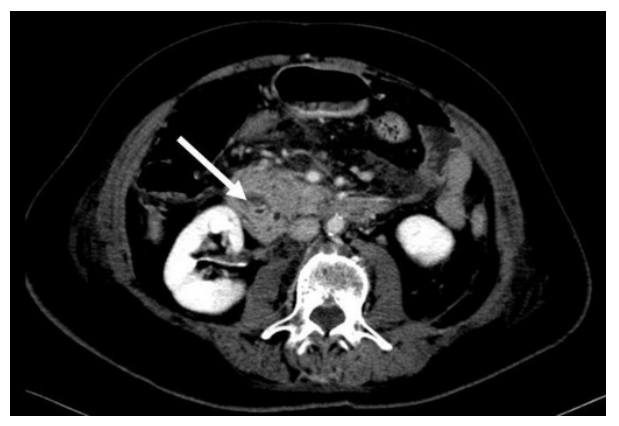
Figure 1. Abdominal CT scan: a ring of inflammatory tissue surrounding the second duodenum (arrow) leading to the diagnosis of annular pancreas and acute pancreatitis confined to the annulus and the adjoining pancreatic head.