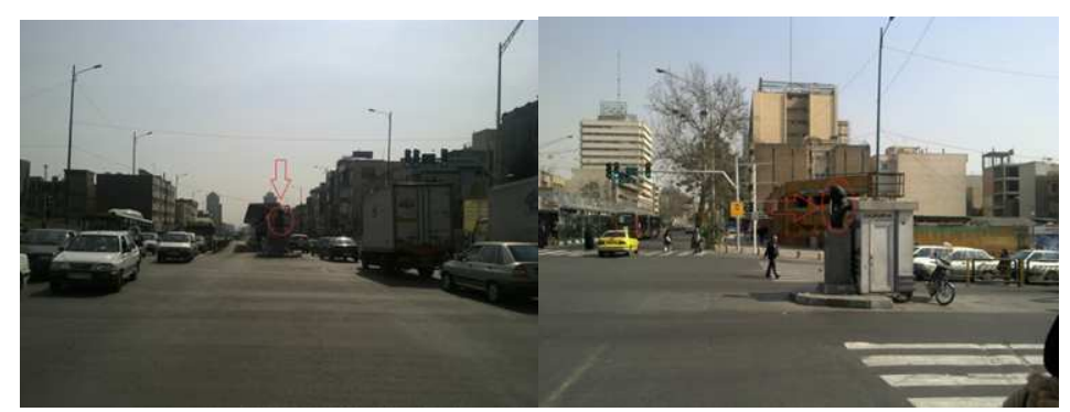
Pictures 3-5: Navvab Safavi Martyr Sculpture (Upperpart), Crossroad of Azadi Street and Navvab Martyr, Personal Archive