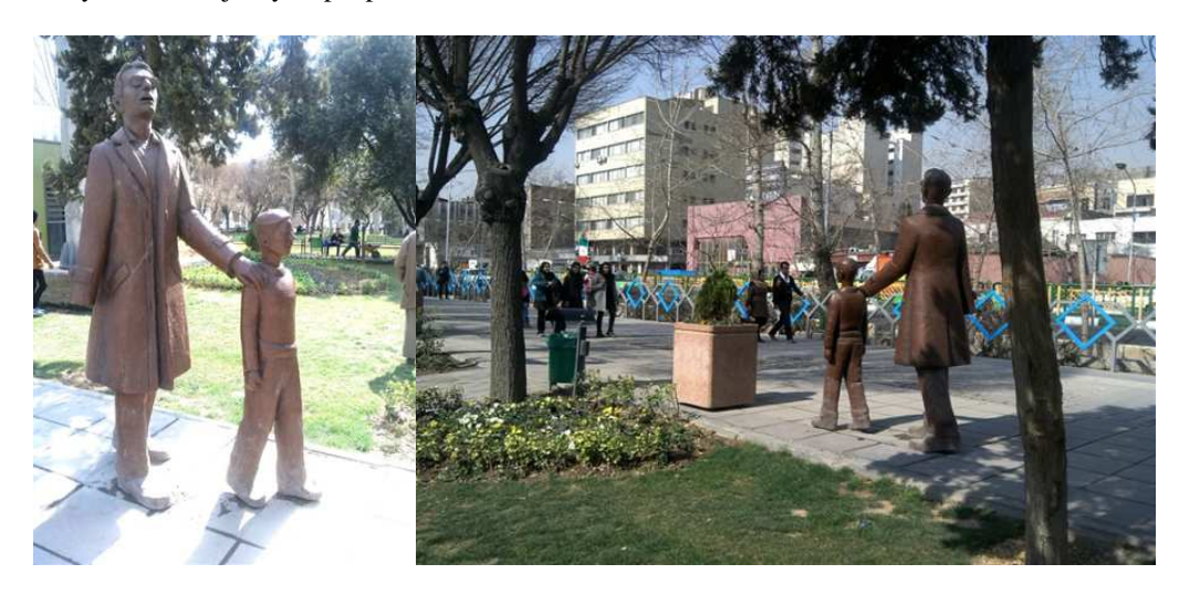
Pictures 1 & 2: Blind, University Park, Northern Pedestrian

At a point on the pavement near student's park, there is recently a mixed sculpture set up. This is the embodiment of a blind person depicting a child, perhaps his son, who has become his stick. They are pedestrians like all other citizens inviting others to their watch with stoppage of time: it summons people to pay attention to the blind living in the community but the majority of people don't care about.