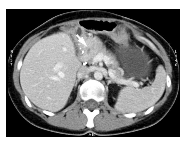
Figure 4. Enlargement of the head of the pancreas (arrow) revealed by abdominal CT scan at 95 months of follow-up.

months later, a tumor (3x3.5 cm) located within the hepatoduodenal ligament and compressing the portal vein was detected (Figure 1). The treatment consisted of a local tumor excision combined with a Roux-en-Y hepaticojejunostomy, as the transection of the common bile duct was necessary for complete tumor removal. The pathologic examination confirmed the diagnosis of metastatic fibrolamellar hepatocellular carcinoma. Sixteen months after the third operation, another metastatic fibrolamellar hepatocellular tumor (5x4 cm) was found (Figure 2) and excised from the space located between the lesser curvature of the stomach and the left diaphragm. This was followed by a CT scan detecting an isolated left intrathoracic nodule 13 months after the fourth operation. The tumor measured about 4 cm in diameter and was located directly above the diaphragm and very close to the caval vein (Figure 3). Resection of this nodule was done at 72 months of follow-up using a left posterior thoracotomy and the