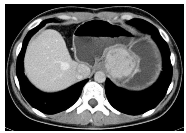
Figure 2. Abdominal CT scan showing a tumor located between the lesser curvature of the stomach and the left diaphragm which was diagnosed 57 months following initial surgery.

Based on this, 23 months after initial operation of the patient two recurrent metastatic fibrolamellar hepatocellular tumors were for the first time found and excised at the Department of Hepatobiliary Surgery and Liver Transplantation, Marie Curie Hospital in Szczecin, Poland where the surgical treatment was continued. The recurrences were located in the lymph nodes adjacent to the pancreatic head (6x5 cm) and in the left retroperitoneal space (7x6 cm). Eighteen