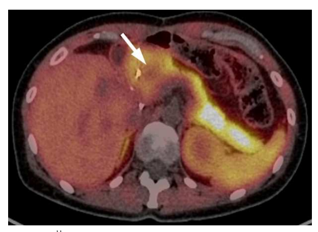
Figure 6. <sup>11</sup>C-acetate PET/CT scan showing a decreased uptake of the tracer within the pancreatic head (arrow) as compared to the remaining pancreatic tissue suggesting the presence of a pancreatic head tumor.

The metastatic pattern of fibrolamellar hepatocellular carcinoma is similar to conventional hepatocellular carcinoma with spread to regional lymph nodes, peritoneum, bones, lung and spleen [2, 11, 12, 15]. However, to the best of our knowledge metastatic spread of fibrolamellar hepatocellular carcinoma to the pancreas was previously reported in one case only, as a