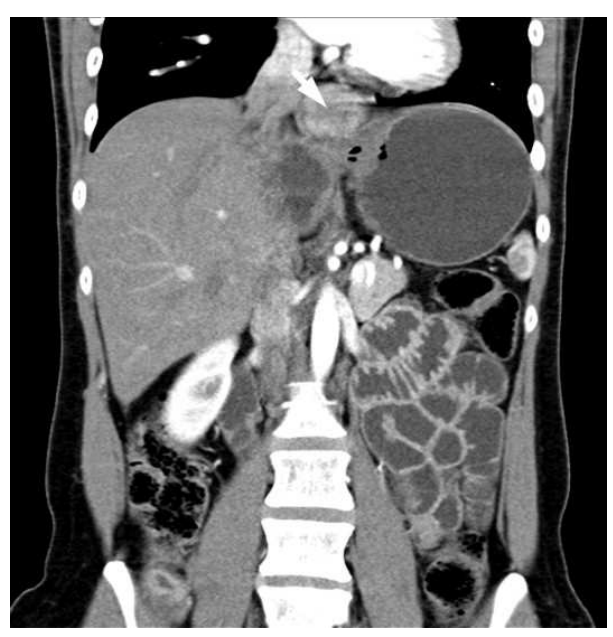
Figure 3. CT scan demonstrating an isolated intrathoracic nodule (arrow) located directly above the diaphragm and close to the caval vein at 72 months of follow-up.

months later, a tumor (3x3.5 cm) located within the hepatoduodenal ligament and compressing the portal vein was detected (Figure 1). The treatment consisted of a local tumor excision combined with a Roux-en-Y hepaticojejunostomy, as the transection of the common bile duct was necessary for complete tumor removal. The pathologic examination confirmed the diagnosis of metastatic fibrolamellar hepatocellular carcinoma. Sixteen months after the third operation, another metastatic fibrolamellar hepatocellular tumor (5x4 cm) was found (Figure 2) and excised from the space located between the lesser curvature of the stomach and the left diaphragm. This was followed by a CT scan detecting an isolated left intrathoracic nodule 13 months after the fourth operation. The tumor measured about 4 cm in diameter and was located directly above the diaphragm and very close to the caval vein (Figure 3). Resection of this nodule was done at 72 months of follow-up using a left posterior thoracotomy and the