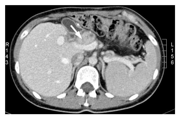
Figure 1. Abdominal CT scan performed at 41 months of follow-up showing lymph node recurrence within the hepatoduodenal ligament (arrow) which is compressing the portal vein.

hepatocellular carcinoma at the Department of General, Transplant and Liver Surgery, Medical University of Warsaw in April 2002. Prior to surgery, the patient's biochemical liver function tests were all normal and hepatitis serology was negative including HBsAg, HBeAg, anti-HBc and anti-HCV. Alpha-fetoprotein was 3.2 IU/mL (reference range: 0-12 IU/mL). During surgery, the lymph nodes of the liver hilum, hepatic artery, celiac trunk, as well as the periaortic and pericaval nodes, were all removed. The pathological examination showed the metastases of fibrolamellar hepatocellular carcinoma in one of the six lymph nodes of the liver hilum and in a block of pericaval nodes (5x2.5 cm) as well. After surgery the patient was followed with routine check-up CT scans performed every 6 months at the Department of Radiology, Marie Curie Hospital in Szczecin, Poland.