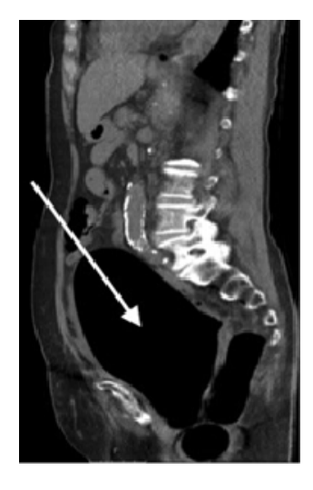
Figure 1 Initial CT abdomen in the external hospital with free infraperitoneal air.

since then she had pain in the abdomen, in the back and the renal flanks on both sides. The patient history showed an appendectomy in childhood and a hysterectomy due to menorrhagia at the age of 41 (1982) (Figures 1-3).