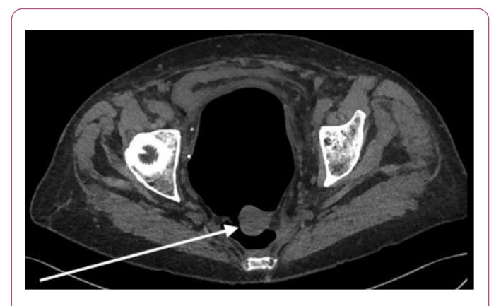
Figure 4 After decompression with expansion of the rectum.

Due to the compression induced postrenal renal insufficiency the decision was made to aspirate the free air pararectal to reduce the infraperitoneal pressure. After previous endosonographic presentation of the rectum, 500 ml air and 1 ml bloody secretion was drained, which was used for microbiological examination with no bacterial growth after a few days. For follow-up control a CT scan was made after the decompression (Figure 4).