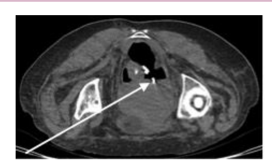
Figure 6 Insertion of a pigtail-drainage into the fluid collection.

Due to a rising CRP value of 293 mg/L two days later a CT scan was made. A new fluid collection was found and drained on the same day CT scan controlled. The drainage extracts turbid brown secretion, so the rectosigmoid perforation was confirmed (Figure 6).