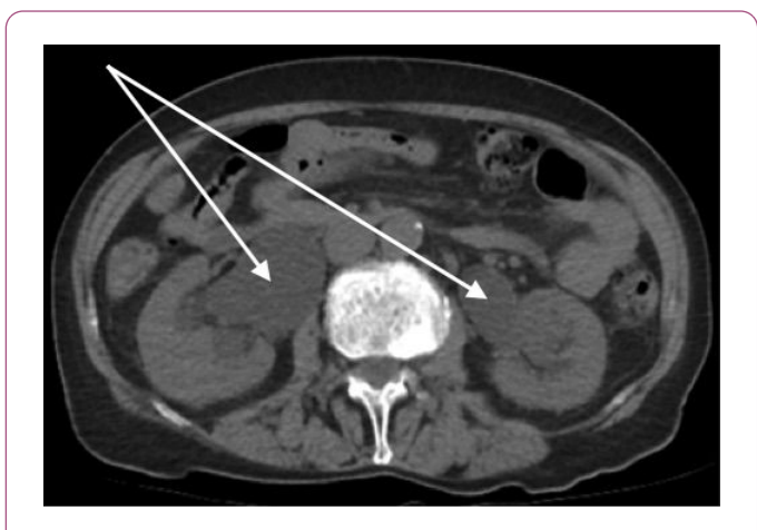
Figure 3 Initial CT abdomen in the external hospital. Dilated renal pelvis by postrenal obstruction due to the high pressure with compression of the ureters.

An empirical antibiotic therapy was started with rocephin and metronidazole on suspicion of a rectosigmoid perforation. On the same day a rigid rectoscopy and a gynecological examination have been performed which showed no perforation.