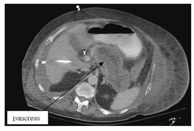
Figure 1. CT scan of the abdomen with contrast (Case #1).

range: 0-160 mg/dL). Serum amylase and lipase levels were 33 U/L (reference range: 36-128 U/L) and 15 U/L (reference range: 8-57 U/L), respectively. Ultrasound of the abdomen revealed a common bile duct diameter of 1.3 cm, cholelithiasis, ascites, an edematous pancreas and a diffusely echogenic liver. Abdominal CT scan with intravenous contrast confirmed the ultrasonographic findings showing ascites, diffuse pancreatitis and gallbladder distension with stones (Figure 1). Patient was hemodynamically unstable for surgical intervention. The hospital course was complicated by septic shock, worsening azotemia, and respiratory failure requiring fluids, vasopressors, broad-spectrum antibiotics, percutaneous cholecystostomy, mechanical ventilation and dialysis. The patient's condition deteriorated over 3 weeks ending with his demise. Serum amylase and lipase levels throughout the hospitalization remained normal. Autopsy revealed severe acute necrotizing pancreatitis with centrilobular hemorrhagic necrosis of the liver and cholestasis.