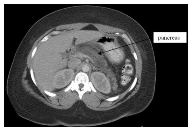
Figure 2. CT scan of the abdomen with contrast (Case #2).

A 37-year-old African-American female was admitted with complaints of epigastric pain and emesis for one day. She denied any change in bowel habits, fever, cough or hematemesis; however she did admit to alcohol ingestion two days prior to admission. She related a history of moderate alcohol consumption and an episode of pancreatitis three years prior. There was epigastric tenderness on physical examination. Laboratory tests showed WBC 9,800 cells/mm<sup>3</sup>, normal liver enzymes (AST 22 U/L; ALT 16 U/L; alkaline phosphatase 55 U/L; total bilirubin 0.6 mg/dL), normal serum triglyceride level (54 mg/dL); amylase and lipase were 95 U/L and 31 U/L, respectively. CT scan of the abdomen with intravenous contrast showed swelling of the head and body of the pancreas with peripancreatic inflammatory changes consistent with acute pancreatitis (Figure 2). Abdominal ultrasound revealed a common bile duct diameter of 3 mm, no gallbladder wall thickening or gallstones. The patient was treated with intravenous fluids and analgesics. Amylase and lipase levels remained normal throughout the admission. Three days