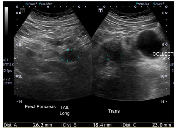
Figure 1. B) Follow-up ultrasound demonstrating hypoechoic region consistent with pseduocyst