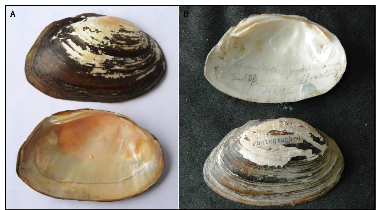
Figure 1: A. Nagarjuna Sagar specimen (68.5 x 43.3 x 23.7) B. Holotype (81.1 x 47 x 30.2)

Distribution: This species has been reported from Bangladesh and from east India-Bihar and Assam. Nesemann's team has reported the species as endemic to the Gangetic delta[5]. The recent paper on the fauna of Andhra Pradesh[6] and an older study on freshwater mollusca in Guntur district of Andhra Pradesh did not report the occurrence of this species[7]. Probably they have missed to collect this particular species. The first author collected four specimens from left bank, near Hill colony, River Krishna, Nagarjuna Sagar, Telangana, India on 27 June, 2014(Figure.1).