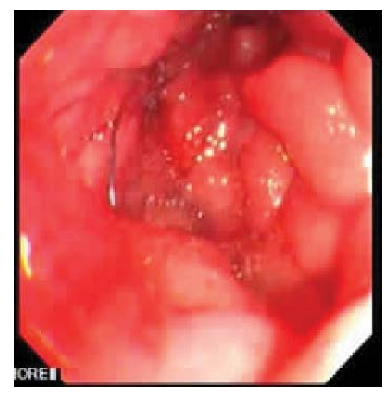
Figure 1. Endoscopy Showing Disease Involving D2 Segment of Duodenum.

Small cell carcinoma is an uncommon neoplasm with