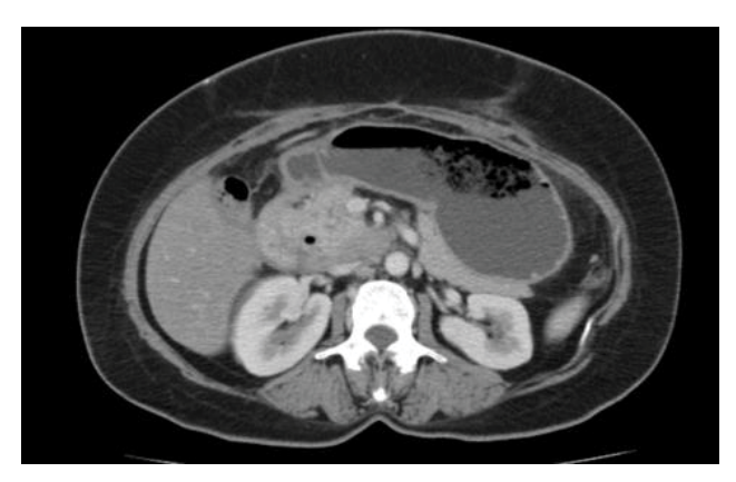
\textbf{Figure 2.} \ \textbf{CT Scan Abdomen with Disease with Head of Pancreas}.