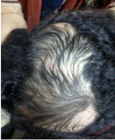
Figure 3 Sisaipho before and after one and two months of treatment, respectively.

really being graced as you've this opportunity every day, please cherish it and be always proud you've chosen this wonderful career.