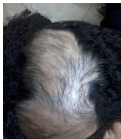
Figure 2 Sisaipho before and after one and two months of treatment, respectively.

treatment regarding AA will take time and they were completely co-operative, I've prescribed 5 mg/kg monthly IM injections of methylprednisolone to be administered twice a day over three days [3]; monthly intradermal injections of triamcinolone 5 mg/ml simultaneously with daily topical application of betamethasone valerate lotion at night. What happened next amazed me before anyone else; an excellent hair growth was easily noticed during the early weeks of therapy (Figure 2). After only 2 months of treatment (Figure 3), I've even begun gradual reduction of the monthly IM steroid injections to be fully withdrawn at 6 months therapy by which I've stopped all the corticosteroids applied even the topical one. No relapse was noticed during or after corticosteroid withdrawal, the hair pattern reached to a nearly normal one at the end of the six months period and the previously shy girl is no longer intimidated to live a normal childhood without harassment from her colleagues laughing at the sight of her hair.