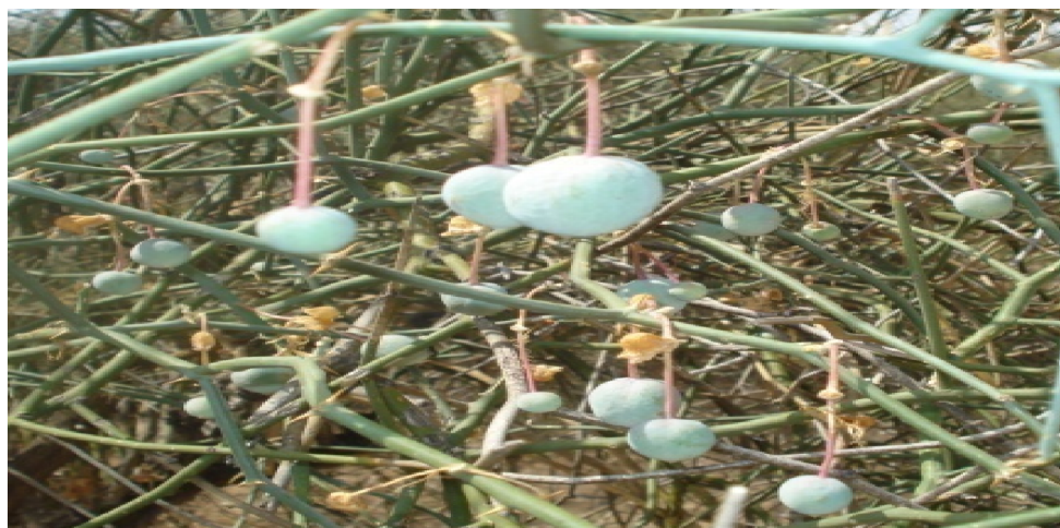
Figure 1. Small tree of the Thar Desert.