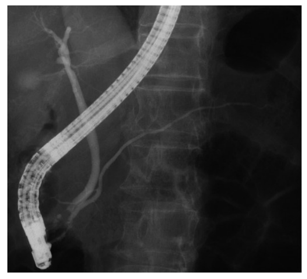
Figure 4. Endoscopic retrograde cholangiopancreatography: There is no anomalous arrangement of the pancreaticobiliary ducts or any anomaly of the pancreatic ducts. Obstruction, narrowing or dilatation of the main pancreatic duct is not observed. The pancreatic duct branches appear normal. No abnormalities of the bile duct are observed.

When making a differential diagnosis, the following disorders need to be considered in relation to lipomatous pseudohypertrophy of the pancreas: obesity, diabetes and age-related pancreatic fat infiltration. Olsen [7] investigated the autoptic findings of 349 cases and observed that different levels of pancreatic fat infiltration were present in all cases, indicating that pancreatic infiltration is associated with aging and obesity. Many patients with diabetes often show similar fat infiltration. However, the imaging findings of these patients revealed a remnant pancreatic parenchyma with uneven fat infiltration, which is