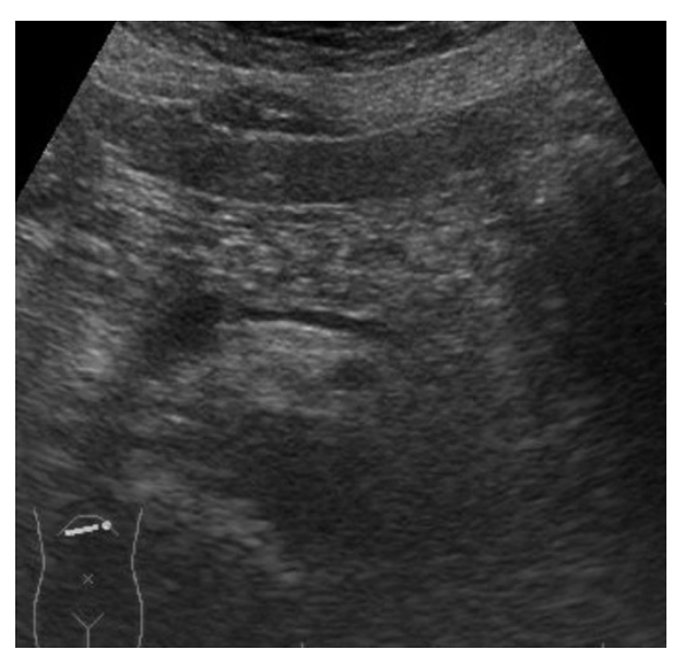
Figure 1 . Ultrasonography. The pancreatic parenchyma is markedly heterogeneous and demarcated from the neighboring tissues by a hazy borderline. The main pancreatic duct is not narrowed or enlarged, and no space-occupying lesion is visible.

the time of admission, her height was 159 cm, weight was 54 kg; and body-mass index was 21.6 kg/m<sup>2</sup>. Furthermore, physical examination did not show any abnormalities. Hematology and serum chemistry analysis (Table 1) revealed normal levels of white blood cells and platelets, mild anemia, normal levels of total protein, albumin and hepatobiliary enzymes, and a marked decrease in pancreatic amylase and lipase levels. Pancreatic exocrine function determined by an N-benzoyl-tyrosyl-p-aminobenzoic acid (BT-PBA) test was substantially low at 28.1%. The 75-gram oral glucose tolerance test (OGTT) revealed a borderline diabetic pattern; however, the preprandial blood glucose level was normal and HbA1c was slightly elevated to 6.0%. Endocrine insulin secretion determined by the glucagon tolerance test was within the normal range, with a delta C-peptide reaction of 1.5 ng/mL.